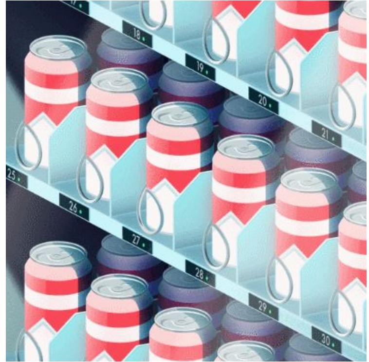
Problems by Parallel Studio